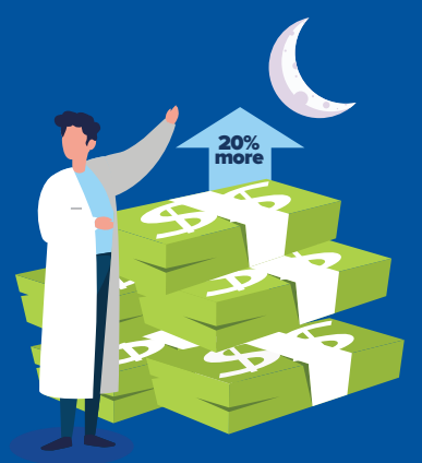
Night-shift hospitalists are paid $20K more annually